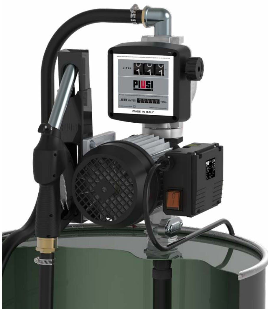
VISCOMAT VANE DRUM